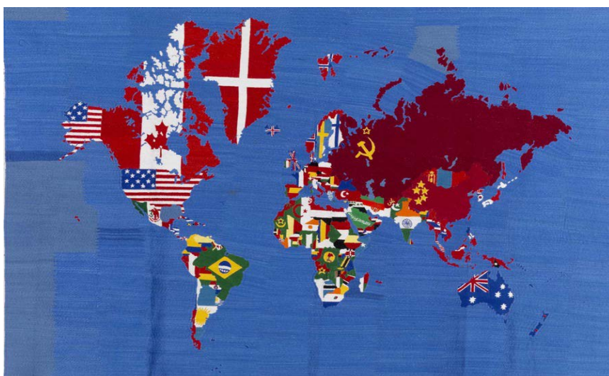
Alighiero Boetti, Mappa , 1979-83

Tornabuoni Art is proud to be exhibiting at Masterpiece London (28 June – 4 July) for the third time with a booth featuring works from the gallery's modern and contemporary collection. Highlights of Tornabuoni's Masterpiece stand include works by Alighiero Boetti, Alberto Burri, Lucio Fontana, Enrico Castellani, Christo and Gunther Uecker.