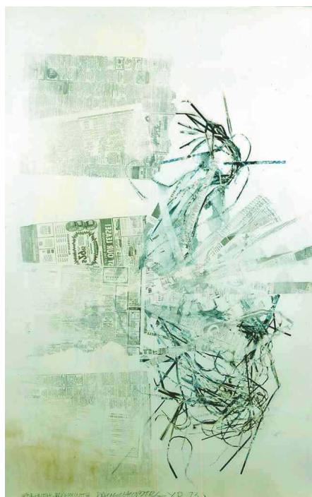
Robert Rauschenberg, For + With Jack + By With , 1960

Artists such as Afro Basaldella, better known simply as Afro, travelled to the United States as early as 1950 and were inspired by the experiments of the American avant-gardes. Indeed the 1950s mark a significant change in Afro's approach to abstraction, which becomes less representational and more experiential. During several trips to New York, Afro developed a close friendship with the artists of the New York School, who came to consider him as the Italian response to Abstract Expressionism. In particular, Willem de Kooning remained a lifelong friend of his, as demonstrated by their correspondence. He even created his black and white paintings of the early 1960s, better known as the 'Rome' series, in Afro's studio. A letter from De Kooning, dated 1960, will be on show alongside a painting from the same year.