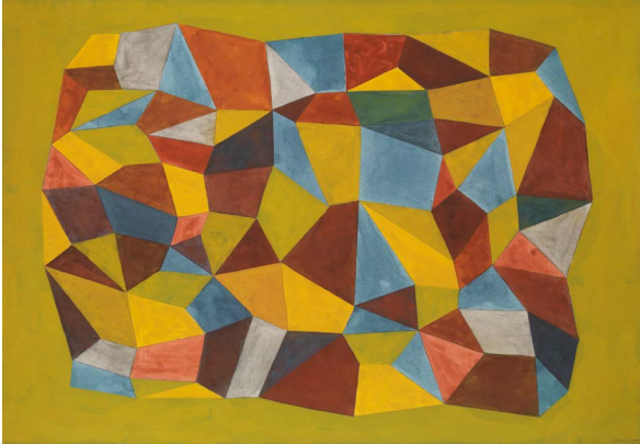
Sol Lewitt, Complex Structures in a Contained Space , 1988

The next year, in 1965, MoMA inaugurated the Responsive Eye exhibition, which showed the works of many artists who explored optical effects and colour. Among them were Josef Albers and Dadamaino, two artists who drew their inspiration from the Bauhaus teacher Johannes Itten and whose research on colour can easily be compared.